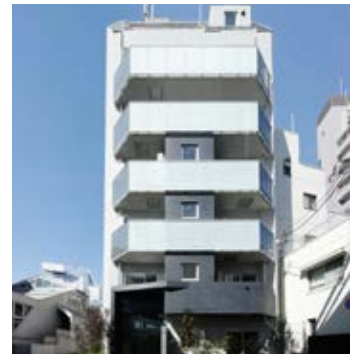
THE COTEAU SHIN NAKANO

Honcho, Nakano-ku, Tokyo COMPLETION SPECS FLOOR AREA Mar.2024 RC/8F 464m