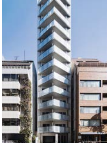
MYRIA RESIDENCE SHINJUKU-GYOEN II MINAMIOOI RESIDENCE (TBD)

Honcho, Nakano-ku, Tokyo COMPLETION SPECS FLOOR AREA Mar.2024 RC/8F 464m