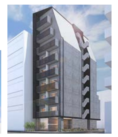
NISHI-SHINJUKU RESIDENCE (TBD)

LOCATION Todoroki, Setagaya-ku, Tokyo COMPLETION SPECS FLOOR AREA Mar.2019 S/3F 404m