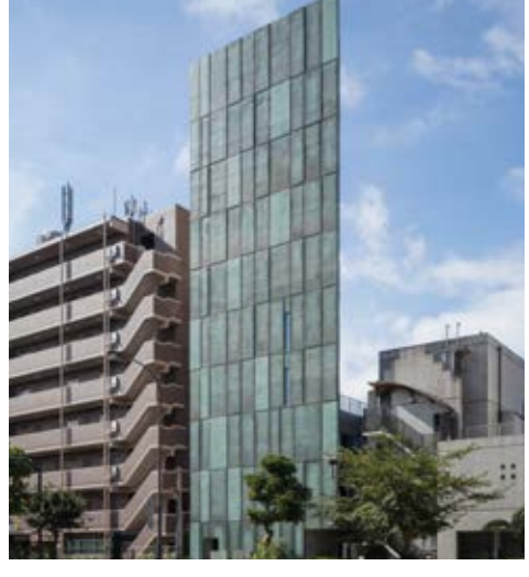
TIME SHARING OOKAYAMA

LOCATION Kita-Aoyama, Minato-ku, Tokyo COMPLETION SPECS FLOOR AREA Sep.2020 RC / 4F 1,670m