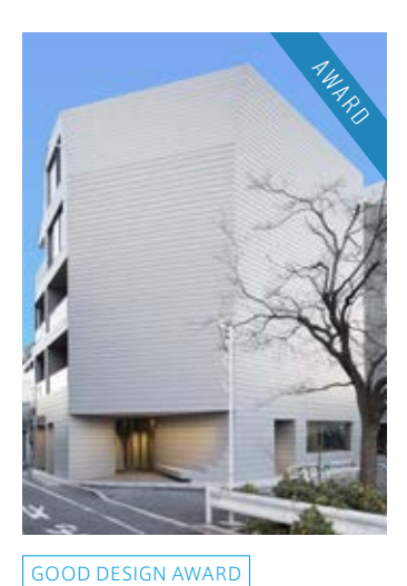
THE CON-TOUR HATANODAI

LOCATION Minami, Meguro-ku, Tokyo COMPLETION SPECS FLOOR AREA Sep.2021 RC/10F 703㎡